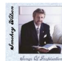
Songs Of Inspiration