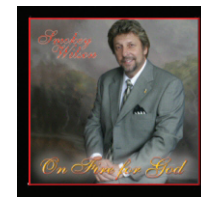
On Fire For God